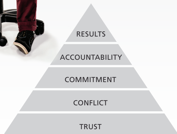
The Five Behaviors of a Cohesive Team Model